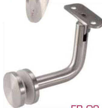
EB 02 Elbow Connector to Glass