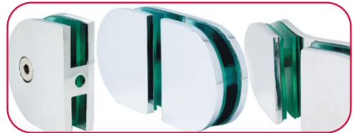
Shower Connectors - Bianca Series