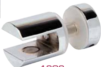
1202 Glass to Glass [Dia. 25]