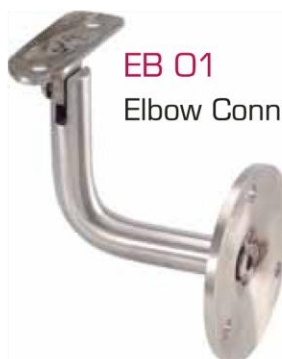
EB 01 Elbow Connector to wall