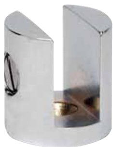
1201 Glass to Wall [Dia. 25]