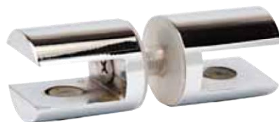
1203 Glass to Glass [Dia. 25]