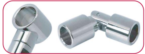
Crossbar Connectors - Caprice Series